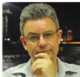
Sam Vaknin (bio)

My Narcissists, Psychopaths, and Abuse YouTube channel (my 5 channels have more than 120,000,000 views and 500,000 subscribers) Transcripts